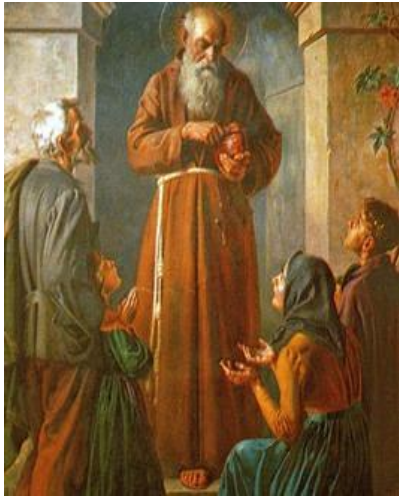
St. Conrad of Parzham

It was God's will that I should leave everything that was near and dear to me.