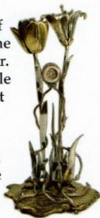
Reliquary of St. Maximilian Kolbe

Franciscan Friars Conventual Our Lady of the Angels Province 12300 Folly Quarter Road Ellicott City, MD 21042 www.olaprovince.org